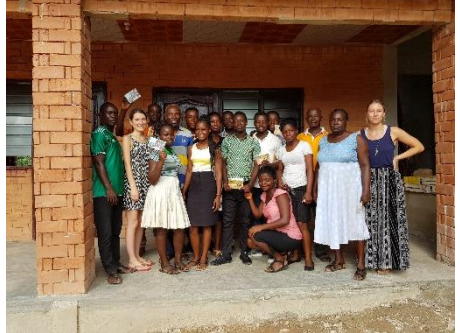
For a more intimate survey we also sent anonymous questionnaires to the staff. One thing became clear during the evaluation: the teachers are very satisfied with their workplace!

We get on very well with the teaching staff and regularly ask for improvement suggestions and opinions from our employees. This time it happened during our annual teachers' conference, where it became clear that the school lacks a lot of sports material and digital resources. We counter this by financing sports equipment and digital teaching materials.