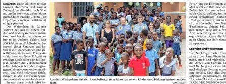
Aus dem Waisenhaus hat sich innerhalb von zehn Jahren zu einem Kinder- und Bildungszentrum entwickelt. Die Kinder sind hier in einem liebevollen Umfeld erzogen und lernen die Grundschulkenntnisse, die für die berufliche Zukunft notwendig sind. Die Kinder sind hier in einem liebevollen Umfeld erzogen und lernen die Grundschulkenntnisse, die für die berufliche Zukunft notwendig sind.

Entwicklungshilfe Trio besucht Projekt „Home For Hope“, das sich seit der Gründung stetig weiterentwickelt.